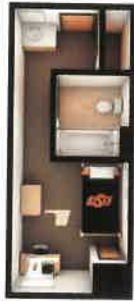
1 Bed, 1 Bath Private Suite