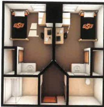
2 Bed, 2 Bath Shared Suite

The Spears Business LLP occupies the fourth floor of Villages E & F, and offers both private or shared suites.