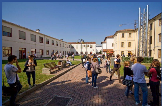
University of Udine